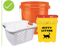
Metal Free Plastic Containers