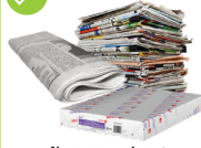
Newspapers, Inserts and Office Paper