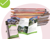
Magazines, Brochures and Catalogs