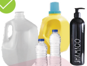
Plastic Bottles and Jugs